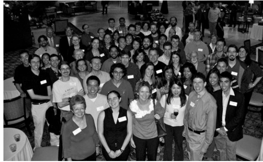
The magnet's 25 th anniversary reunion in 2010

network among Magnet students, parents, teachers, and alumni. Fundraising from this community has helped to support and sustain the Magnet's programs and activities.