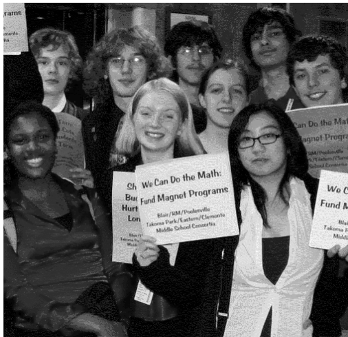
Students protest budget cuts in March 2008

The Magnet Foundation was formed by a group of concerned students, parents, teachers, and alumni in the summer of 2008 in the wake of budget cuts that threatened the Magnet.